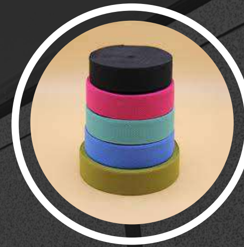
TWILL TAPE UNIT