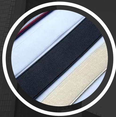
ELASTIC LABEL UNIT