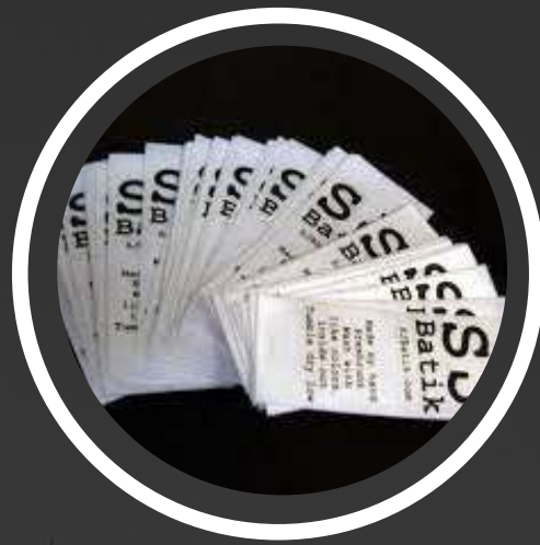
PRINTED LABEL UNIT