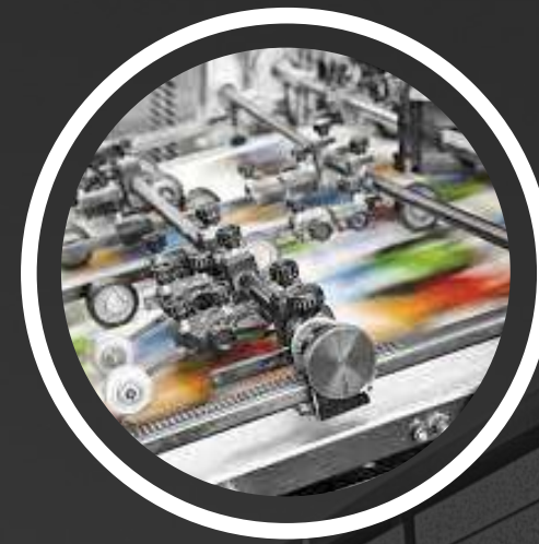
OFFSET PRINTING UNIT